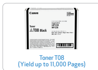
Toner T08 (Yield up to 11,000 Pages)

Use of Canon GENUINE toner cartridges helps provide longer equipment life, high yields, reliable performance, high-quality output, and minimal jamming or issues.