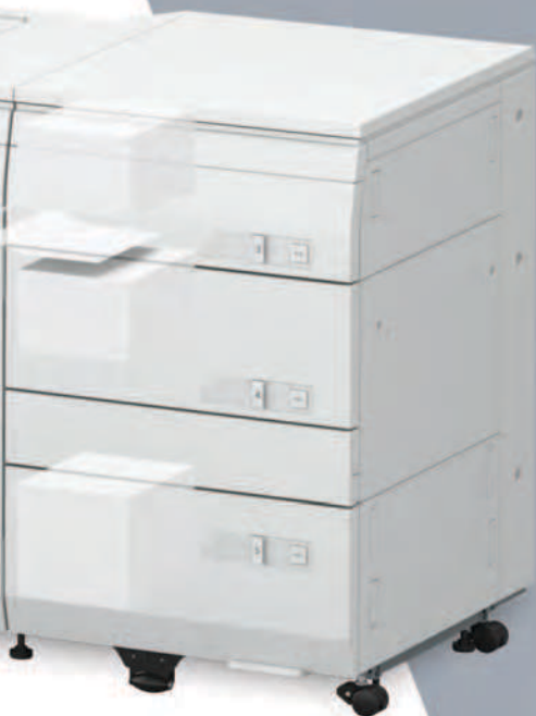
imagePRESS V1000 shown with optional accessories.