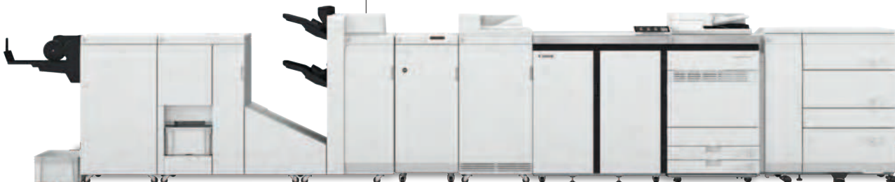
imagePRESS V1000 shown with optional accessories.