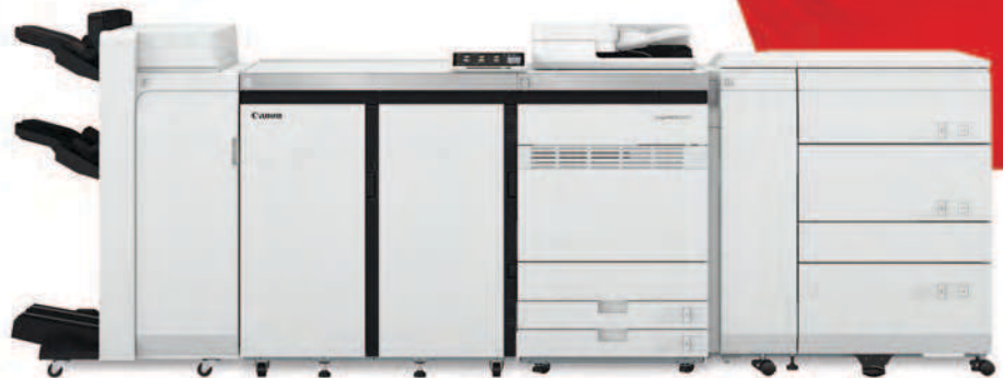
imagePRESS V1000 shown with optional accessories.